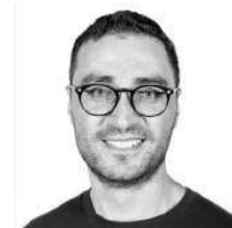
Hayk Hakobyan Vision Capital